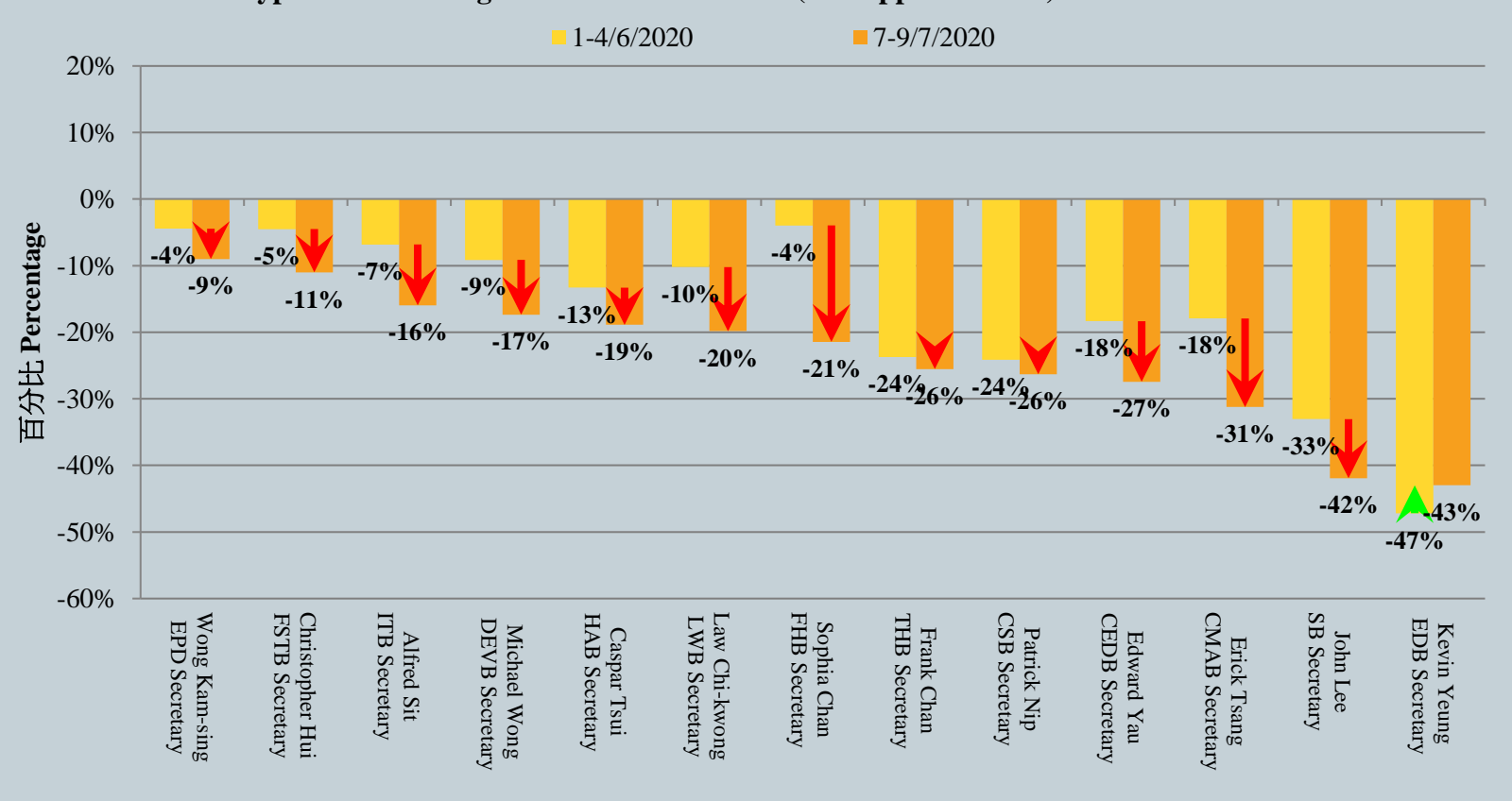
各局長假想投票結果 (支持率淨值) - 綜合圖表 Hypothetical Voting of Directors of Bureau (Net Approval Rate) - Combined Charts