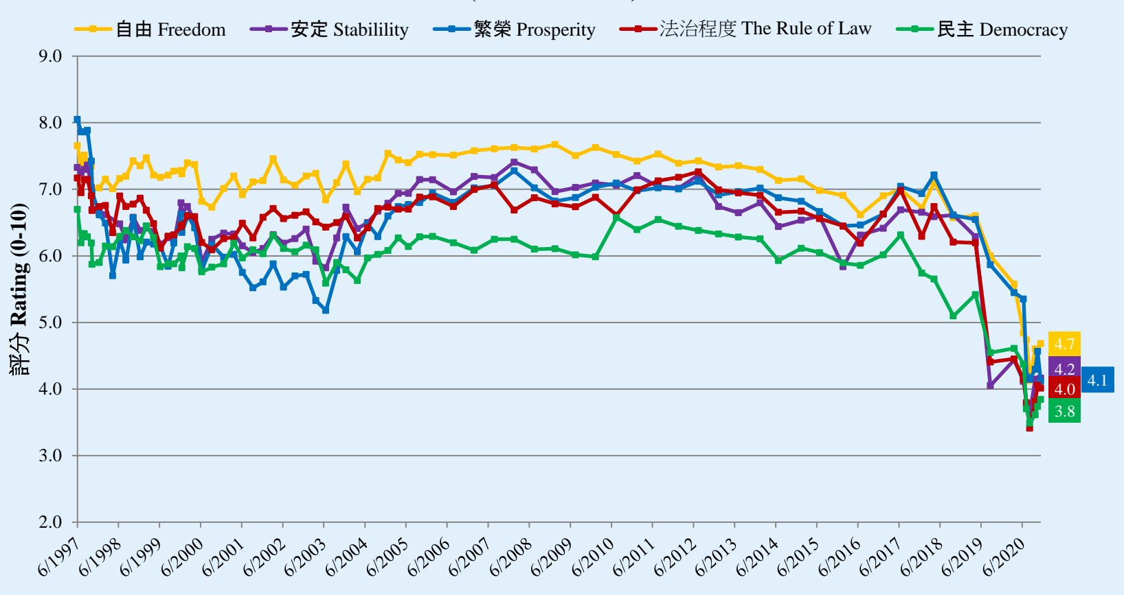
調查月份 Month of Survey