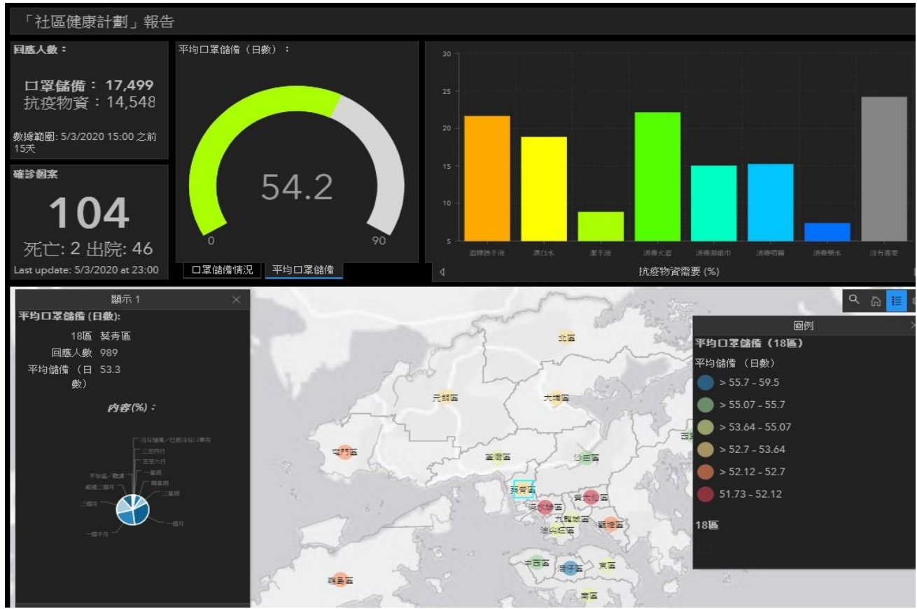
# The CHIS map is temporally available in Chinese only, the English version is under construction.