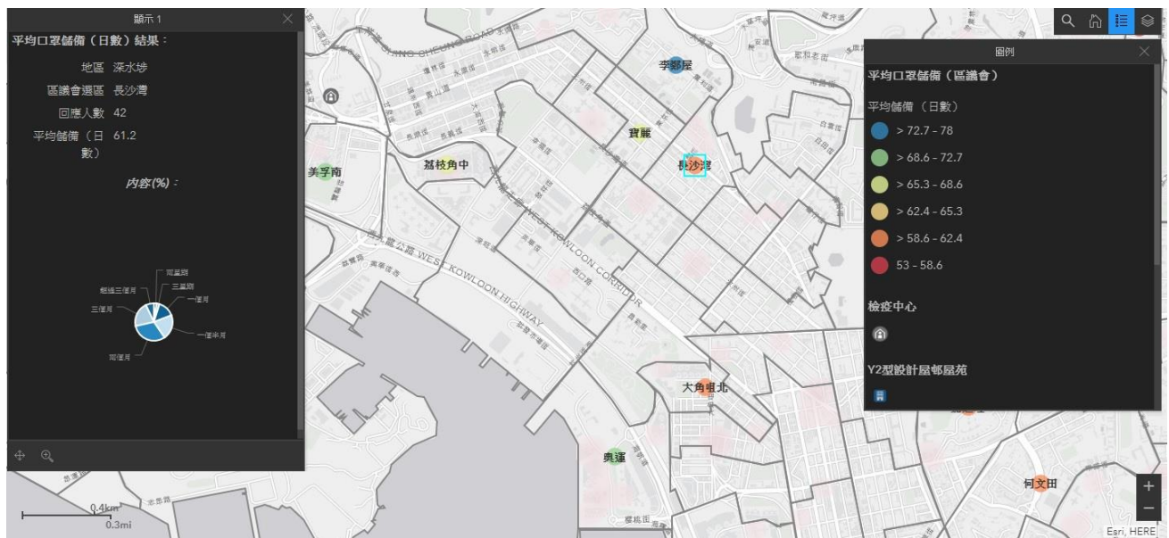
# The CHIS map is temporarily available in Chinese only, the English version is under construction.